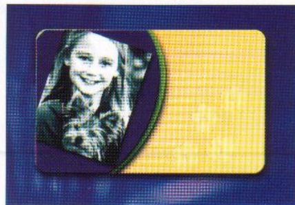
Technical Achievement Winner: Tactile Card