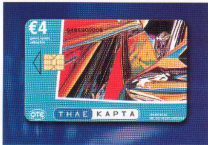
Best Phone Card Winner: Reflections 3