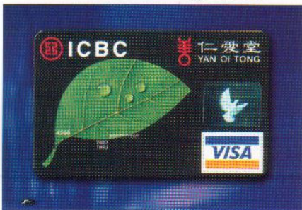
Best Financial Card Winner: Yan Oi Visa Classic Card